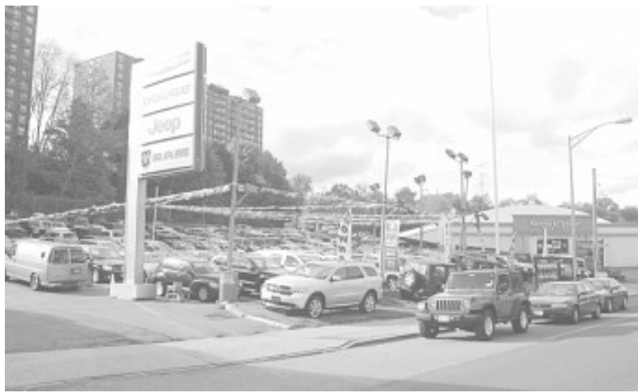
BELOW: With a huge selection of new and pre-owned vehicles on the lot, there is something for everyone at Central Ave.