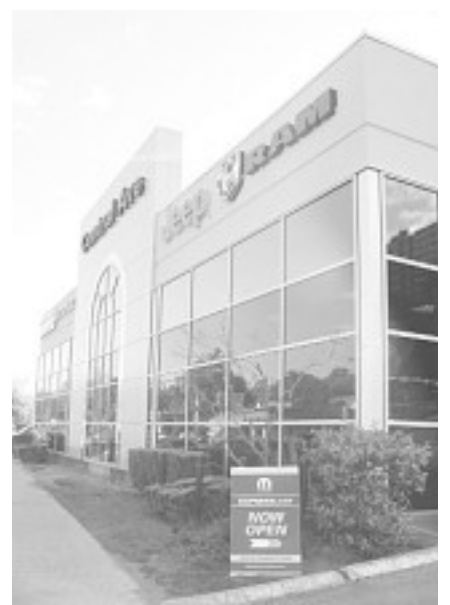
The dealership has undergone a massive facelift for the Grand Reopening.

Central Avenue Chrysler-Jeep-Dodge-Ram is at 1839 Central Park Avenue in Yonkers. The salesroom is open Monday — Thursday 9:00am-8:00pm, Friday and Saturday 9:00am-6:00pm, and Sunday 11:00am-4:00pm. Call: (914) 961-5400 or visit www.centralavenuechryslerjeep.com .